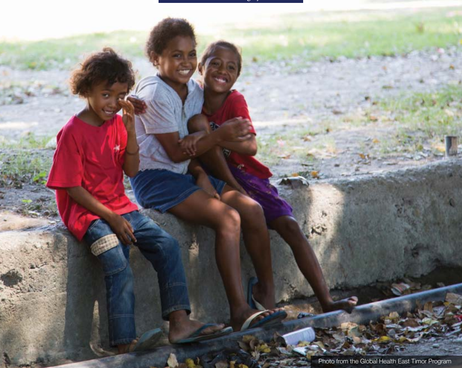
Photo from the Global Health East Timor Program

All children, families and communities should be able to access safe and quality surgical care when they need it most